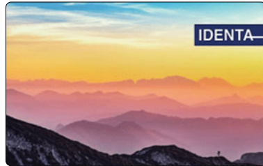
Standard Card PVC (so-called IDENTACard)