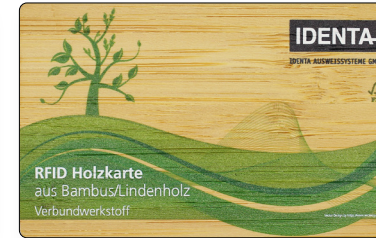
RFID wooden card