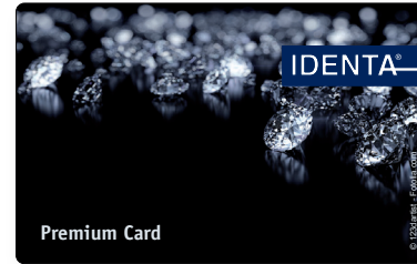
Premium Card HT