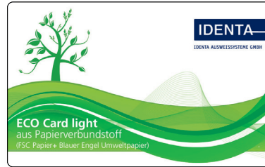
ECO Card light